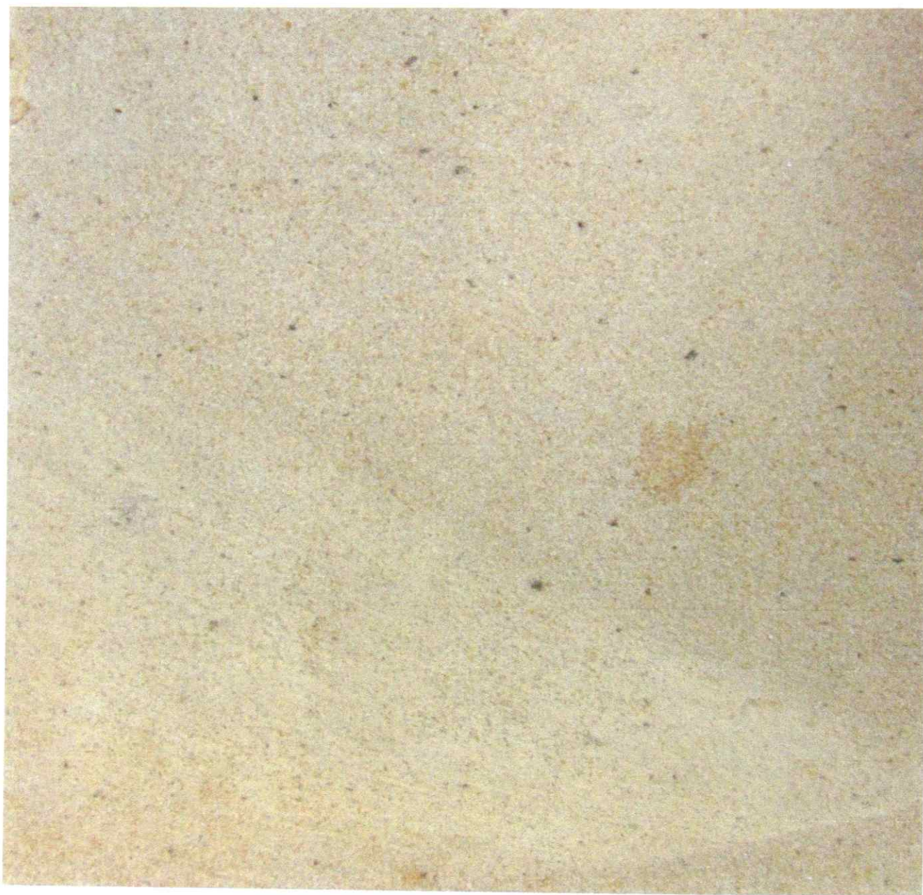
Sample as Received